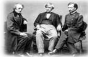
Judges John Bingham, Joseph Holt and Colonel Henry Burnett