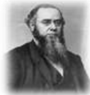
Secretary of War Edwin Stanton

I can only speak for myself when I say that the most significant reason there are so many books, YouTube videos and TV documentaries still being presented about the Lincoln conspiracy is that mainstream history allows only one point of view regardless of all else. If any scholars wish to be recognized as an authority on the Lincoln assassination, they must not challenge the findings and decisions handed down to us by Edwin Stanton's military tribunal judges.