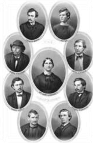
This depiction of the assassination conspirators is incorrect.

As 21 st -century United States citizens can we now look back to the first assassination of an American president and proudly say that truth and justice prevailed over evil and tyranny?