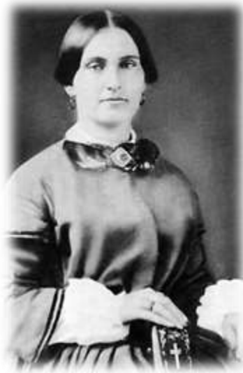
Mary Elizabeth Surratt

Was it not indeed in the best interest of the nation to have her executed?